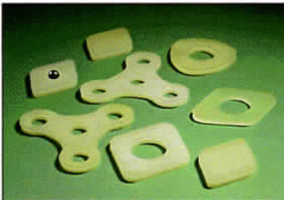
Various styles made up in white FDA KRYPTANE® material