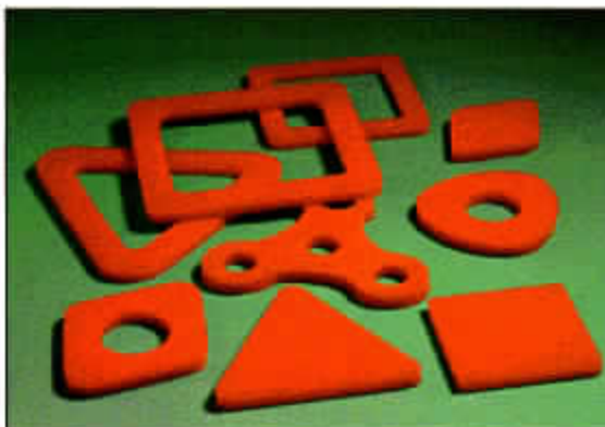
Various styles made up in red FDA KRYPTANE® material

Sifter Cleaners are of vital importance in the processing of flour.